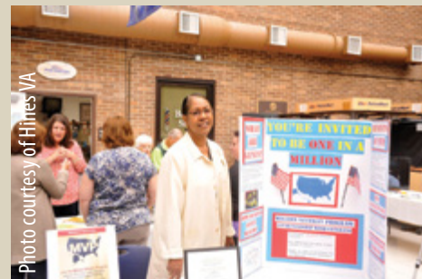
Staff at the Edward Hines, Jr. VA Hospital in Illinois recruited Veterans for MVP during VA National Research Week this past spring.

To mark this milestone, local sites across the country organized events that not only recognized the work they had done, but also honored our MVP Veterans, who have so generously donated their time, history, and blood toward a brighter future for all. ●